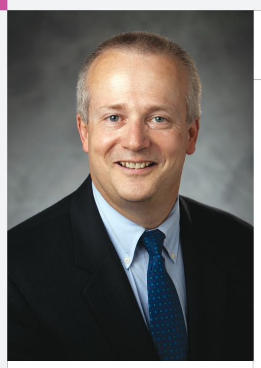
"To be a relentless force for a world of longer, healthier lives."