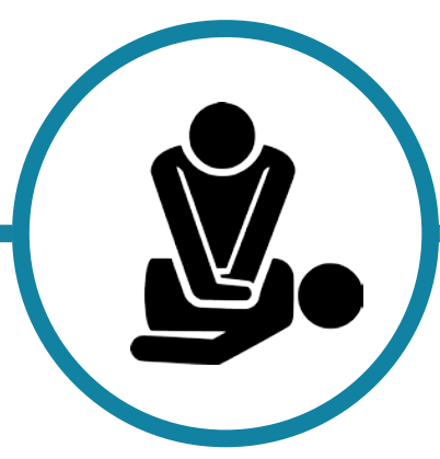
High-quality CPR is the foundation of resuscitation.