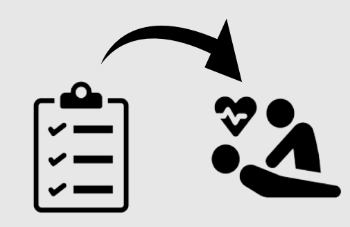
Establish links between performance outcomes in training and patient outcomes.